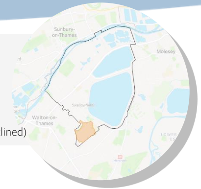
The LSOA is highlighted within the ward (outlined)

Index of Multiple Deprivation (IMD, 2019) ranks within Surrey (out of 709): 1st = most 'deprived'